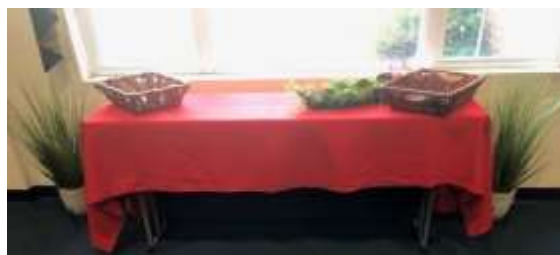
Table of Joy

Bible Study Tuesdays 6 p.m. – 7 p.m. Student Ministry Worship Worship Center Friday 6 p.m. – 8 p.m.