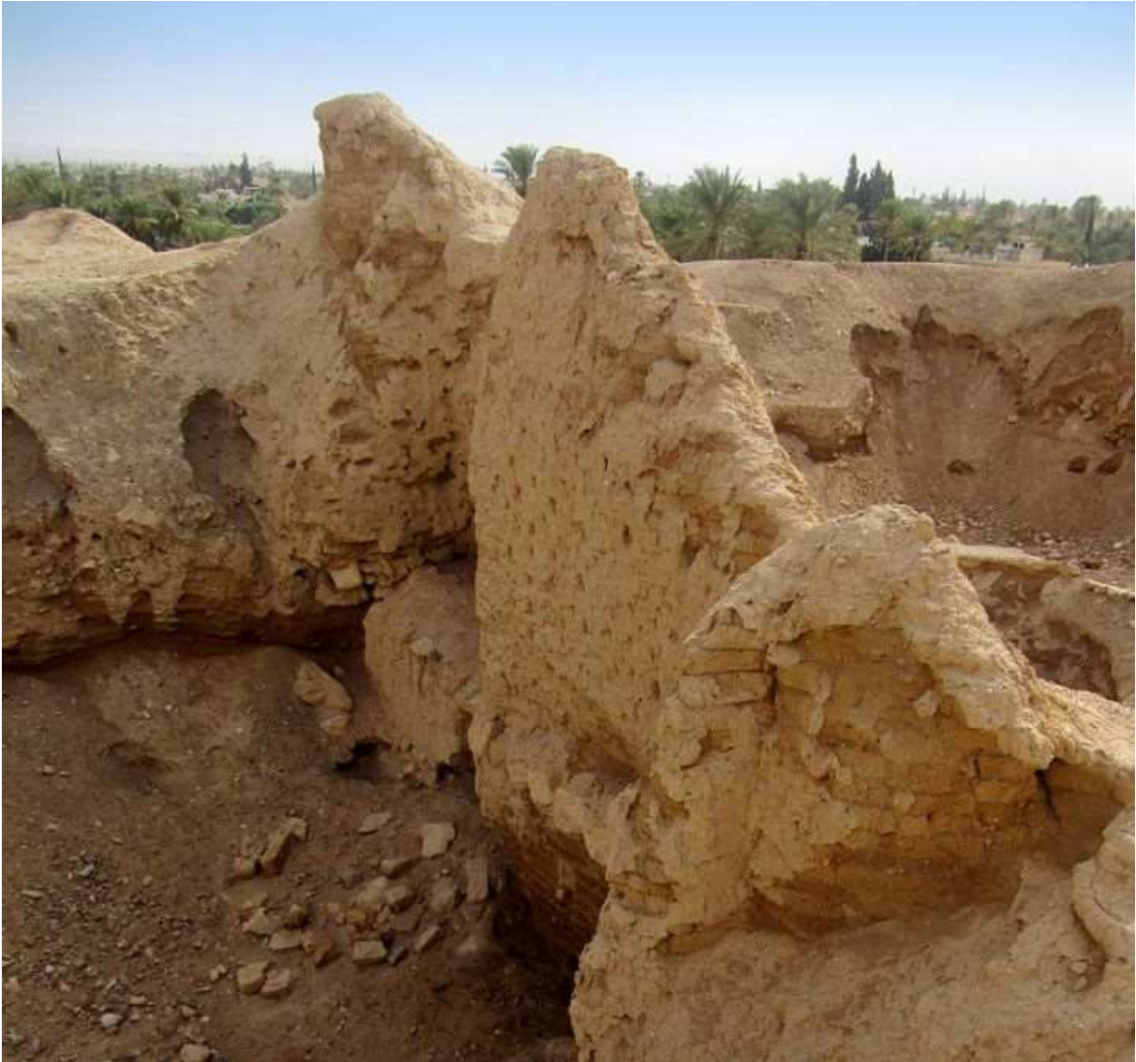
Section of the northern wall of Jericho which not collapse. Rahab's house was likely in this area of the city.

Around 8,000 BCE, the town also featured an 8.5-meter (28-foot) tall stone structure called the Tower of Jericho, which is considered to be the world's first stone building of this kind. Discovered by archaeologists in 1952, it's a cylindrical tower that has a top platform that's reached by 22 steps on the inside.