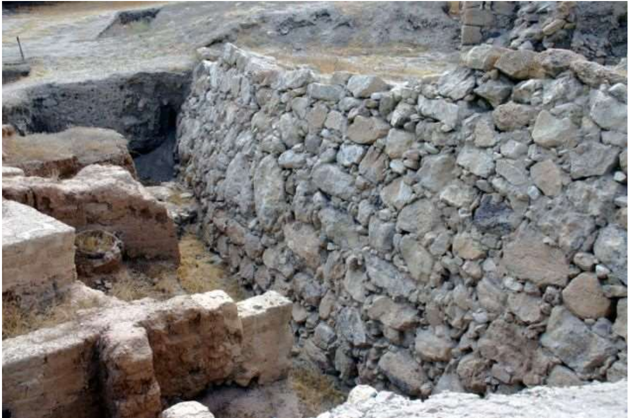
The southern portion MB II revetment wall at Old Testament Jericho. The red brick outer wall would have stood on top of this revetment wall.

Upon the revetment the walls would have been constructed of red bricks which have been discovered at the base. King Herod would later construct a palace near the former city. The pictures below show the use of red bricks.